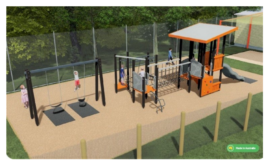
Indicative Design of the South Junior Playground

We are in the planning stage of an exciting upgrade of both playgrounds at the Riverview Caravan Park.